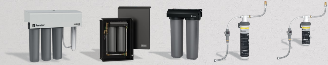
HYBRID G13 FILTERWALL WH2 PUREMIX Z6 & Z7 PUREMIX Z1 & Z2