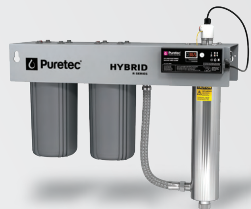
HYBRID R1 (AU) | R3 (NZ)

The Puretec Hybrid R Series is a highly effective and efficient system to remove dirt, rust, sediment, bad taste, odour & bacteria from your water. Choose an installation location that is protected from the weather.