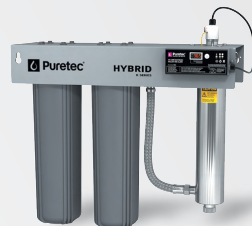
HYBRID R2 (AU) | R4 (NZ)

75 Lpm, 1" Connection, Power Surge Protection