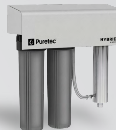
HYBRID G7 (AU) | G9 (NZ)

DUAL STAGE, 10" MODEL 75 Lpm • 1" Connection • Power Surge Protection